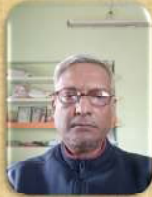
ARUP KUMAR DAS (Author)

SOVEREIGN PRINCIPAL AUTHORITY OF THE UNITED NATIONS JUSTICIARY (EMPOWERED BY SCIENTIFIC AND PHILOSOPHICAL EQUANIMITY OF MIND)